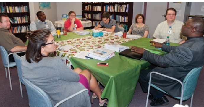
Typical CPE group meeting.

A unit of CPE consists of 400 supervised hours. At least 100 hours are spent in the group process, and at least 300 hours are spent in direct ministry to persons. Several hours a week are required to complete outside assignments.