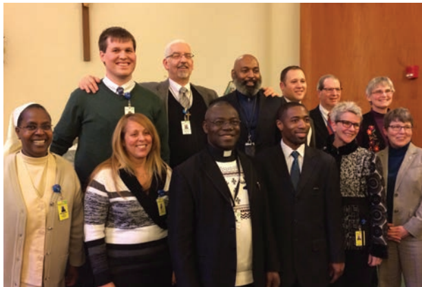
Graduation of CPE Group.

"Our hand prints don't fade from the lives we touch."